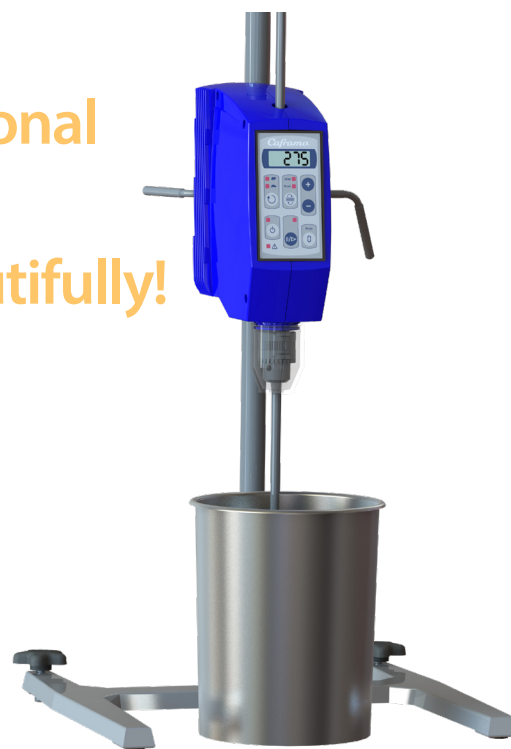
Cosmetic lotion emulsions